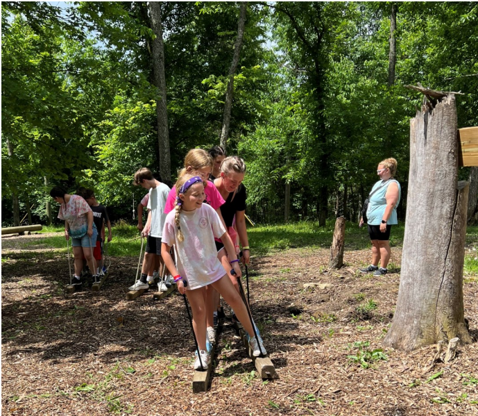
Three “trolley teams work to together to trolley to the finish line.