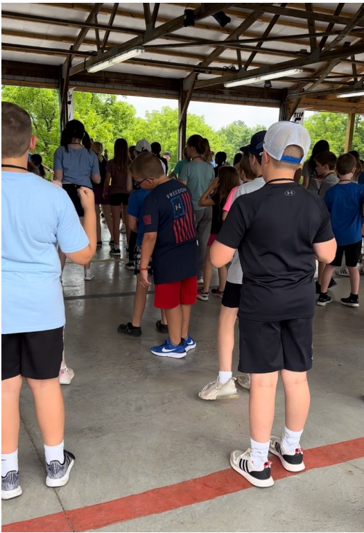
Line Dancing at 4-H Camp.