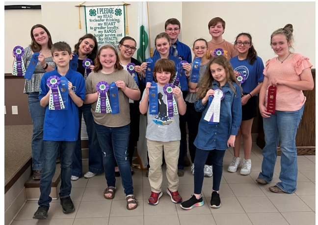
4-H COMMUNICATION DAY WINNERS