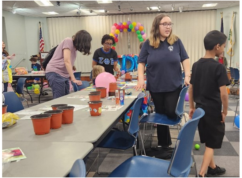
4-H Event held in Lexington KY on April 14 at the Fayette County Extension Office.