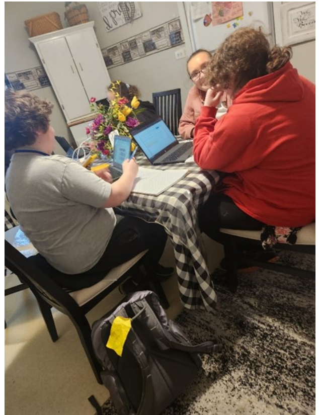
4-H Teens Tutoring other Teens as part of their community Service & Leadership project